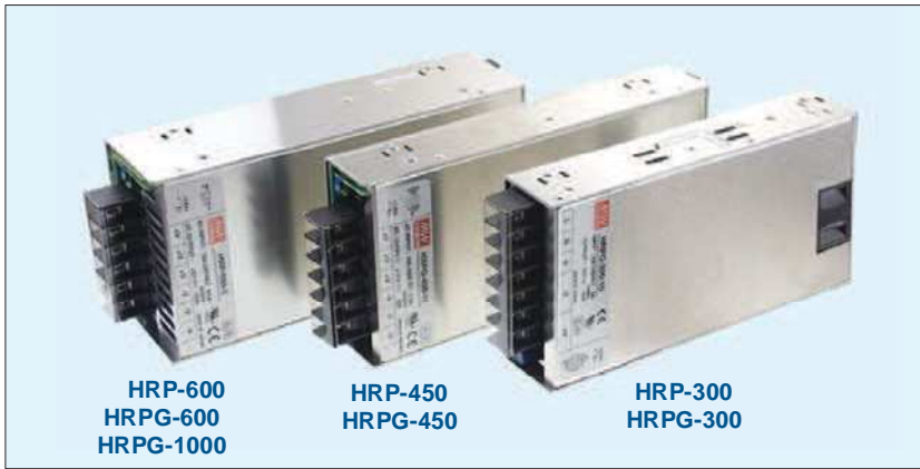
HRP-600 HRPG-600 HRPG-1000